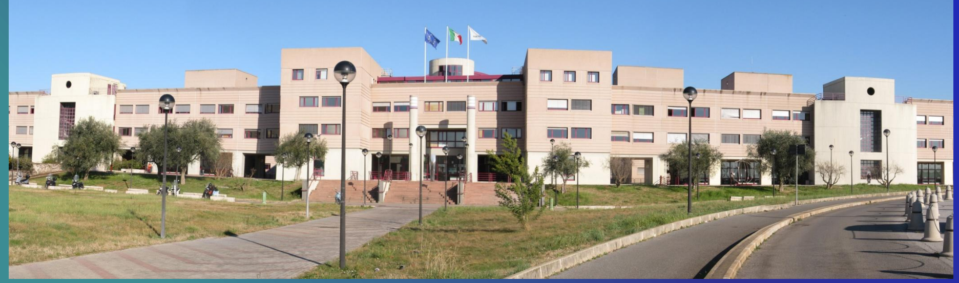
Master's degree in Medicine and Surgery